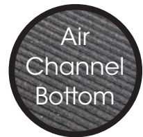
Air Channel Bottom